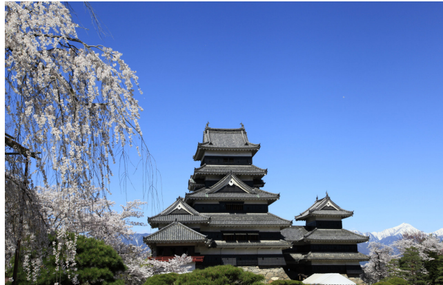
Matsumoto Castle

Matsumoto Castle is distinguished by its deep black keep, which stands majestically against the backdrop of the Japanese Alps. Like the castles of Himeji, Hikone, Inuyama and Matsue, it is designated a National Treasure. Built during the Sengoku period (Warring States period) in the 15 th and 16 th centuries, it houses the oldest surviving keep. The keep was built in times of war, whilst the moon-viewing tower (Tsukimi Yagura) was added in times of peace. These architectural styles from different eras coexist in harmony. Matsumoto Castle is a symbol of the city of the same name.