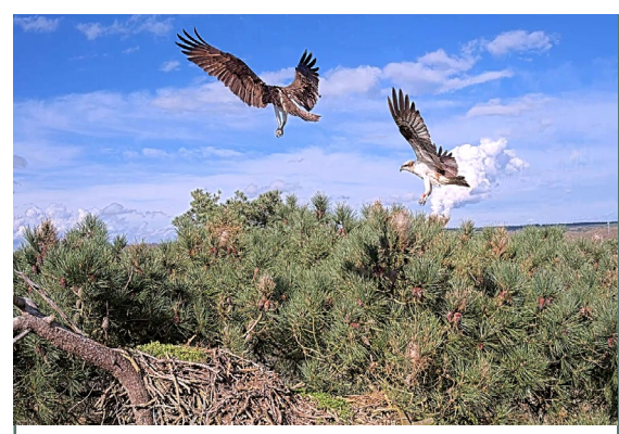
Arrival of the ospreys, 10 March 2024 at 3:10 P.M.

Chambord is currently the second French site for osprey reproduction; every year, from March though September/October, seven to nine couples nest in the estate.