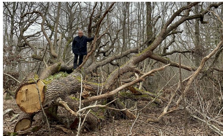
Wang Keping checking out felled trees in the Chambord woodlands, 2023

Wang Keping has been represented by the Galerie Nathalie Obadia in Paris and Brussels since 2017.