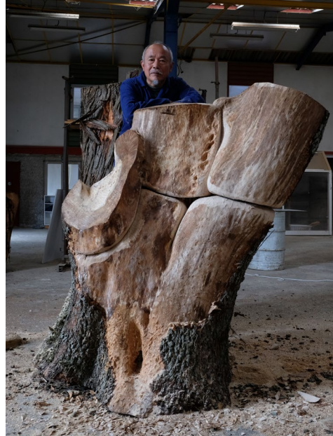
Wang Keping in his Vendée studio, 2019 © Aline Wang, Courtesy of the artist and the Galerie Nathalie Obadia, Paris and Brussels

His sculptures show strains of primitive art, Chinese traditional sculpture and also the work of Brancusi, but it is the sensuality of wood that his work conveys above all, an erotic dimension that from the carved, burned and polished surface forms a skin, an object of desire. In formal terms, his vocabulary prefers generous, ample shapes inherently expressing the material's generative force.