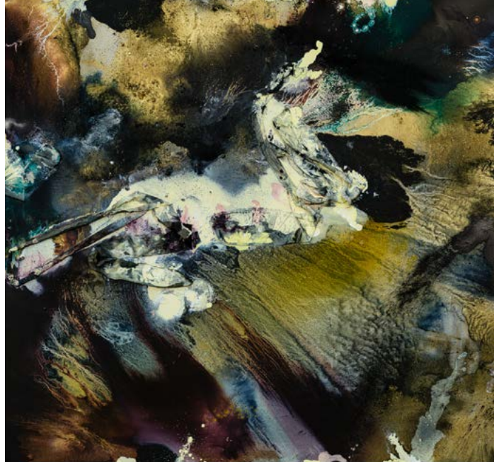
Lionel Sabatté, Chevauchée, chrysalide , 2022 - Oil, fragments de of silk, dusts from the Chateau de Chambord on canvas, 180 x 195 cm